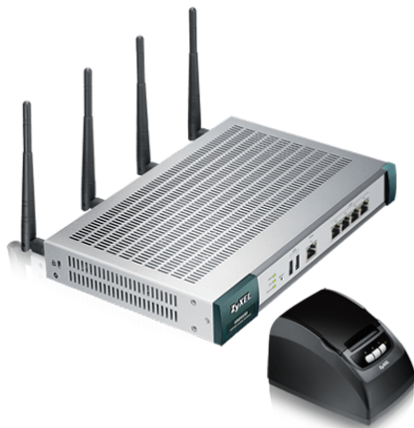
SP350E Service Gateway Printer