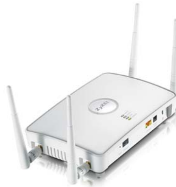
ZyXEL NWA3560-N 802.11 a/b/g/n Wireless Business Access Point