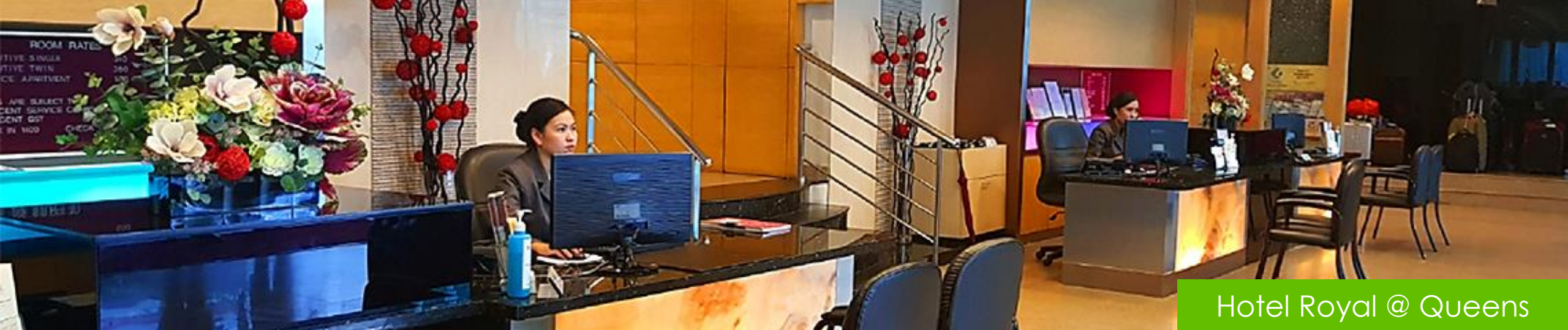
Hotel Royal @ Queens