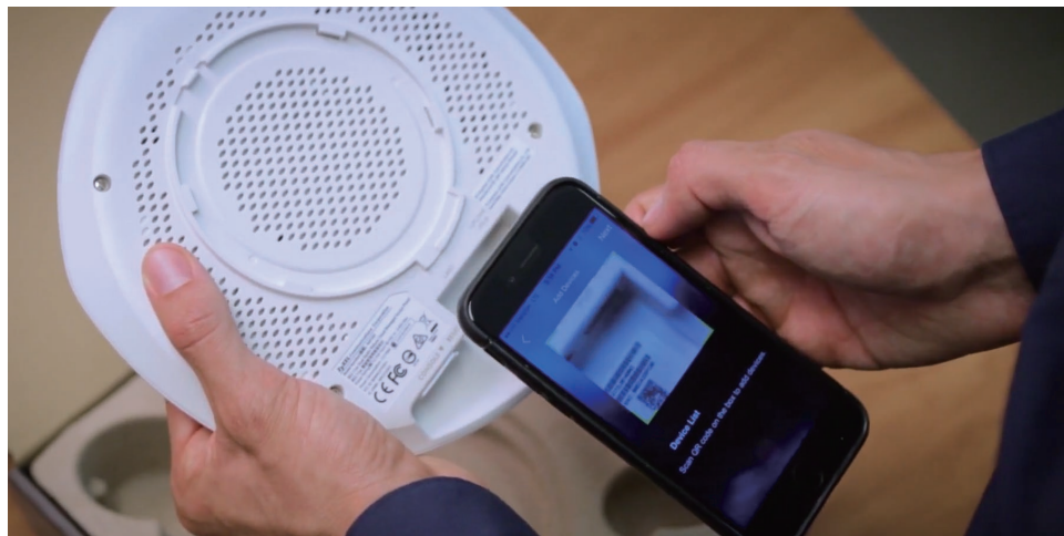
Nebula allows for easy device registration by scanning the QR code on devices

To address their unique networking challenges, Canfield and Vail deployed the Zyxel WAX650S 802.11ax (WiFi 6) Access Points, XS1930-12HP Smart Managed PoE Switch and USG FLEX 700 Firewall. “This was my first experience with WiFi 6 and Zyxel’s APs performed a lot better than I expected,” Vail said. “In areas that are separated by two to three inches of thick steel, I was able to get excellent speeds of between 100 to 200 Mbps throughput on the other side of what would effectively be six inches of steel plating and at over 200 feet away from the access point. With our legacy system, I would have to have multiple access points in the middle to achieve that.” He also stated that while the unique structure of the historic battleship provided challenges to mounting the APs throughout the ship, the provisioning and deployment of the APs was easy.