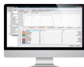
NetAtlas EMS NetAtlas Element Management System