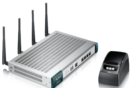
SP350E Service Gateway Printer